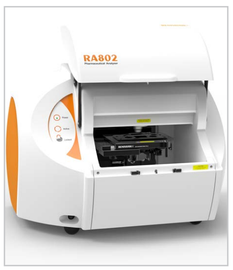
Renishaw RA802 Pharmaceutical Analyser

CoA is just one of the many parameters that can be generated from the chemical images, but it does give a good overview of tablet uniformity; any value appreciably different from zero indicates that the constituent is not uniformly distributed.